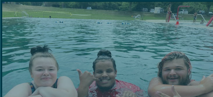
Homeless Youth & Young Adults