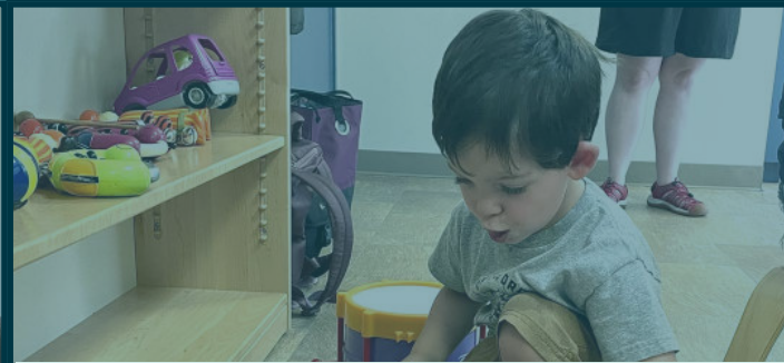
Early Childhood & Family Support